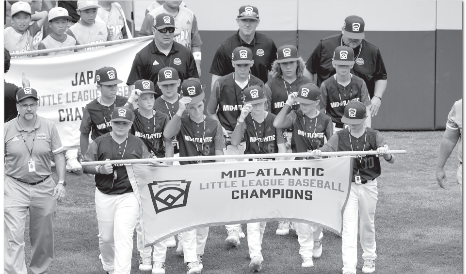
The Hollidaysburg players proudly carried their Mid-Atlantic championship banner to Williamsport.

was able to top the performance of another Pennsylvania team that it made it in 2021.