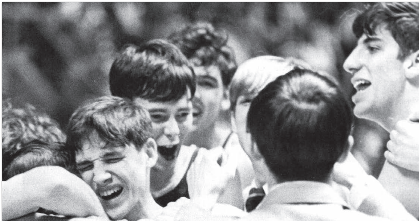
After beating Allentown Central Catholic, the BG celebration was on.