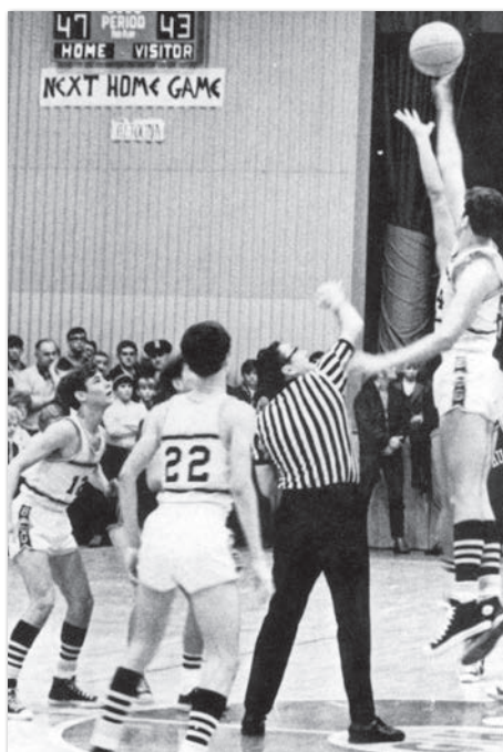
BG home games packed the Pleasant Valley Gym.